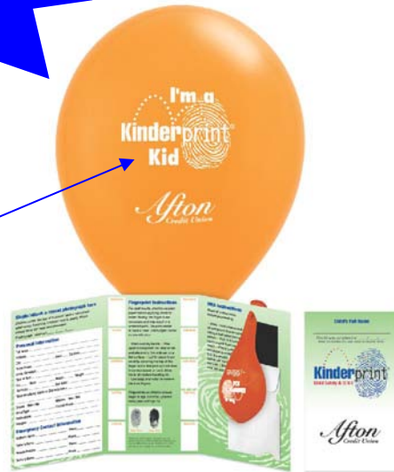
Stock English Kit

Stock "I'm a Kinderprint Kid" artwork is available at no additional charge. Use alone or with your logo. (Design #301635)