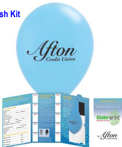
Stock Spanish Kit

See reverse side for pricing and ordering details.